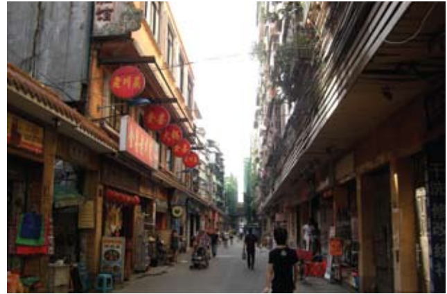
Street in Guangzhou, China.

The students met with the Canadian consulate in Hong Kong to learn about growth and opportunities there. "In a population of 7 million, there are a quarter of a million Canadians living there...they really want Canadians to come over. They really like the education we've got and our