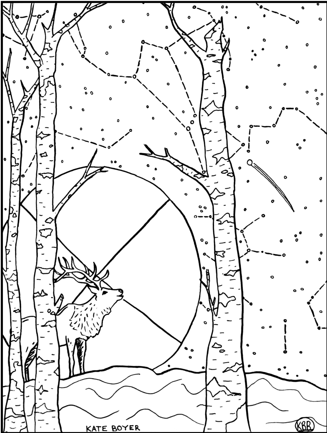
From artist Kate Boyer: This picture shows a background of constellations that I often see in the winter sky. There is also a medicine wheel that is in the place of the moon. Elk have been an important animal to Métis people for food. There is snow on the ground and birch trees in the foreground. I chose those particular trees because they grow on the river bank where I grew up.