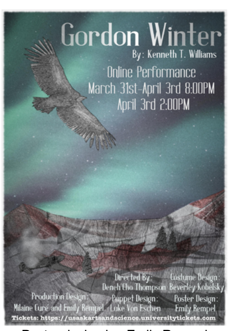
Poster design by: Emily Rempel

Like Gordon Winter (see page 2), Unity (1918), our third and final production of 2020-21, will focus on life in Saskatchewan. But while the action now shifts back to the pandemic of 1918, stay tuned as our Greystone team moves into its third adventure with producing theatre during the pandemic of 2020-21.