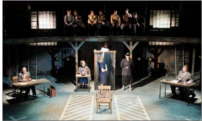
Episode 8: The Law.