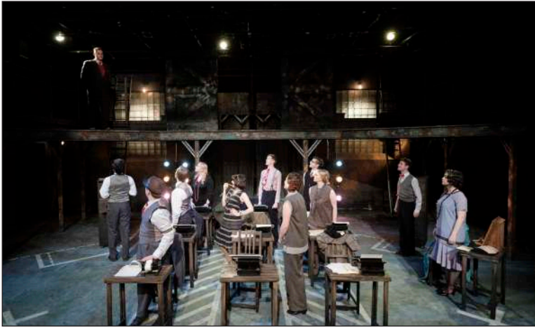
Episode 1: To Business (Cast looking up to their boss)