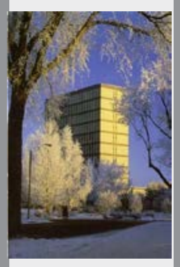
We acknowledge that we live and work on Treaty 6 Territory and the Homeland of the Métis. We pay our respect to the First Nations and Métis ancestors of this place and reaffirm our relationship with one another.

Phone: 306-966-1666 Email: political.studies@usask.ca