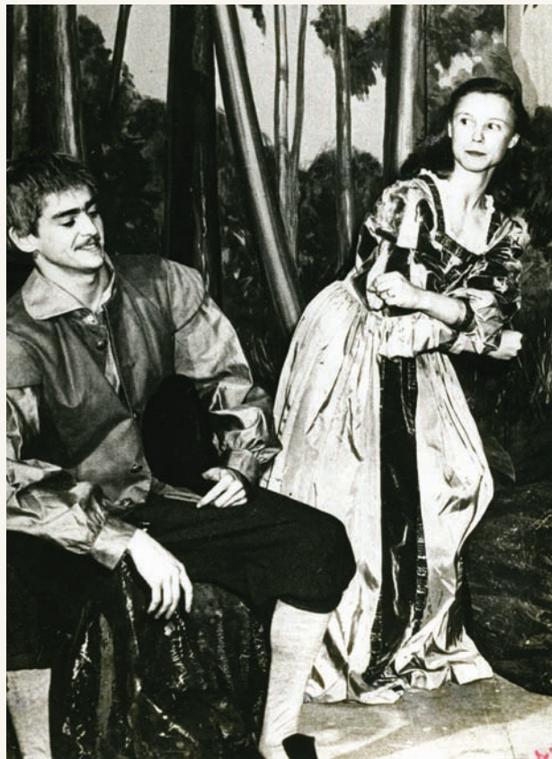
Scene from A Doctor in Spite of Himself

The first summer tour involved productions, in towns all across Saskatchewan, of Moliere's A Doctor in Spite of Himself and the "Pyramus and Thisbe" excerpt from Shakespeare's