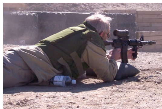
Afghanistan 2004