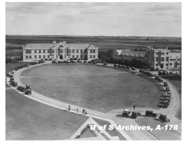
1924 view of The Bowl from atop Chemistry

Students in the large introductory organic chemistry courses initially were not so fortunate. Most of the laboratories for these courses remained in the old laboratory wing of the 1924 building after the opening of the extension in 1966. Although gutted and refurbished with new lab benches and fume